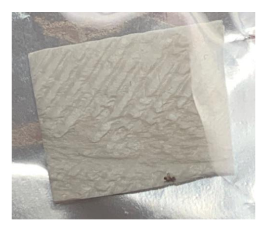
Figure 1. A portion of AmnioCord - a thick membrane derived from umbilical cord used to promote wound-healing

Retrospective analysis of 89 UCF repairs & post-op outcomes from 2016-2018, using GEE models